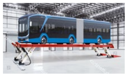
Platform lengths up to 14.5 metres