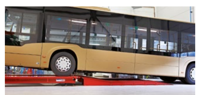
Versatile modular drive-on ramps