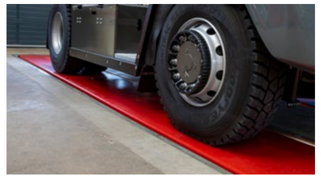
Flush with the floor and ideal for low clearance vehicles

Flush mounted, semi-flush mounted, or surface mounted each model is possible with the SKYLIFT. This heavy duty vehicle lift is suitable for a wide range of vehicles and workshop situations.