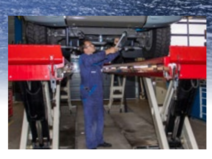
Maximum vehicle access