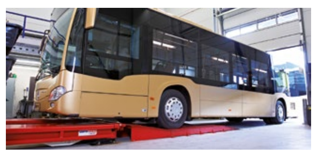
Fixed end-stops or "drive-thru" versions