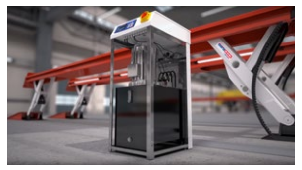
Removable side panels for easy maintenance