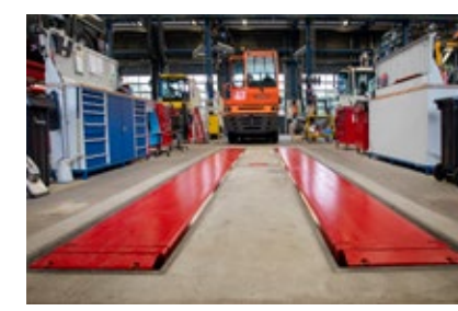
Flush mounted with Reverse Roll-Off

Safety is one of Stertil-Koni's top priorities. The automatic Reverse Roll-Off Protection System with optimum safety prevents the vehicle from inadvertently rolling-off of the lift. This system also effectively lengthens the platform lengths compared to conventional platform lifts. This option is available for all SKYLIFT models and can be fitted to existing installations.