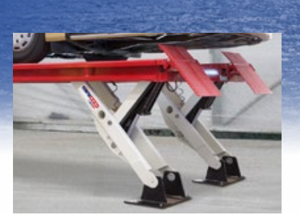
Easy access Y-shaped construction